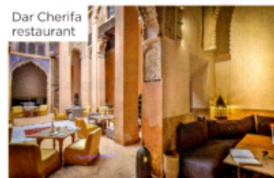
Dar Cherifa restaurant

Saint Laurent (museeyslmarraakech.com), with its superb collection of iconic pieces from the late designer.